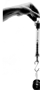
Find the weight in Newtons