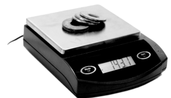
Find the mass in grams, then convert to kilograms